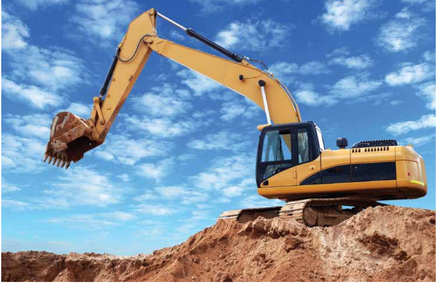
Monitoring engine loading and hydraulic pressure allows the control system to improve digging productivity while working to optimize fuel consumption.